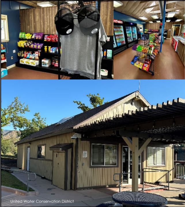
United Water Conservation District