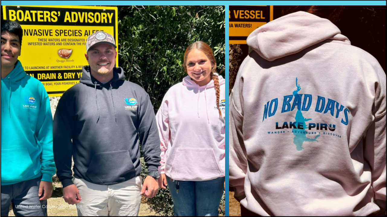
United Water Conservation District